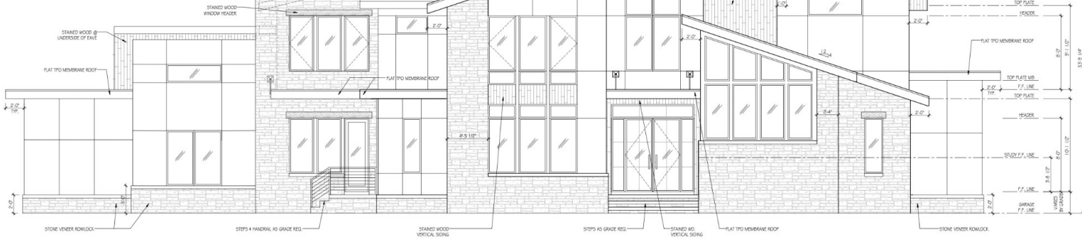
FRONT ELEVATION SCALE: 1/4"=1'-0"